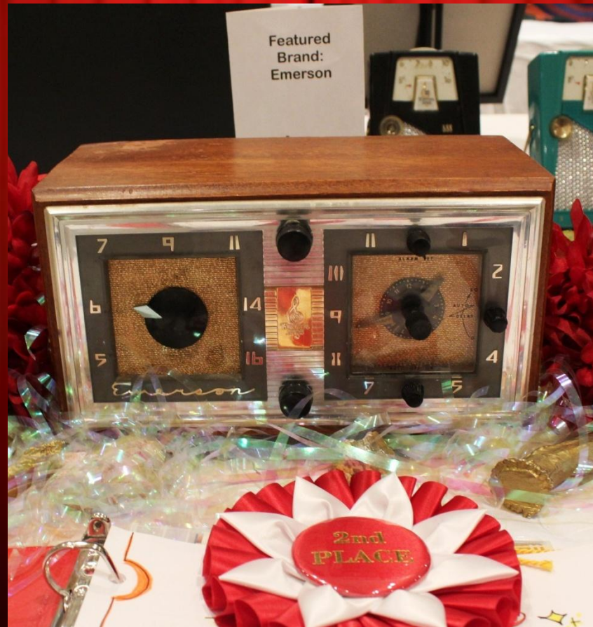
Valkyra Dimitriadis Emerson 738 B