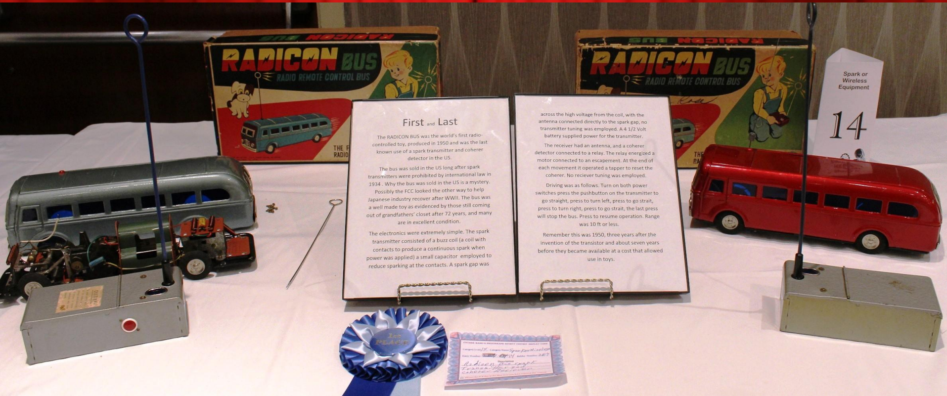
Thomas Burgess Radicon Radio Controlled Bus